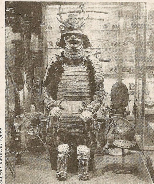
GALERIE JAPON ANTIQUES

store's business star- ting World War II, and the posed into a center for ter it was purchased in Post Office Staff Super- hose president at the artano (it is now owned ère Lyonnaise).